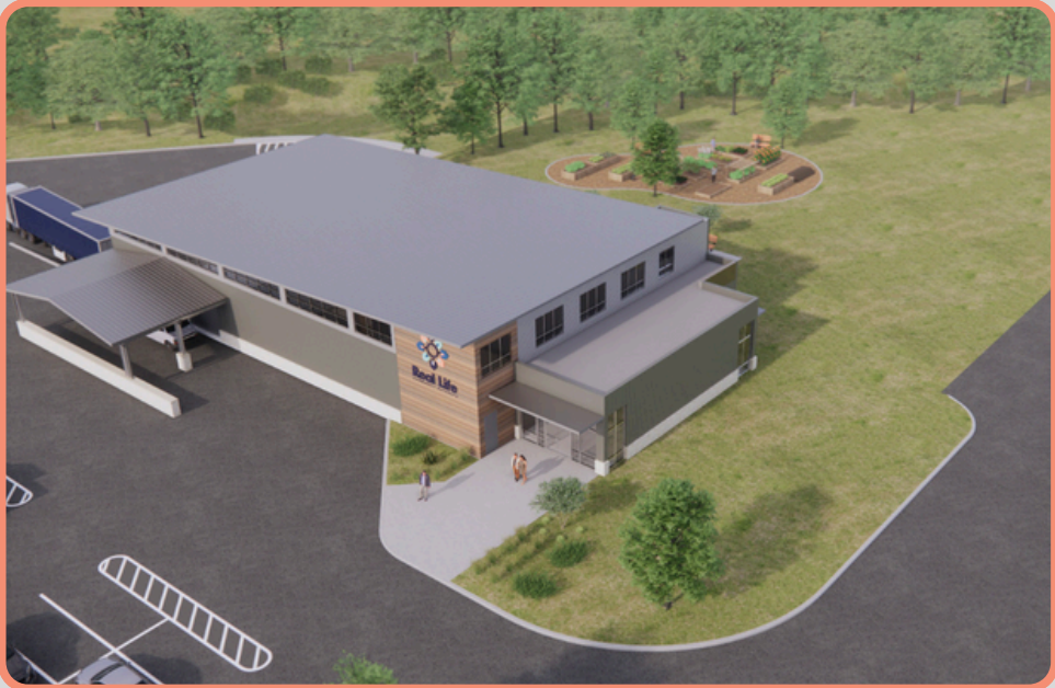
“The Real Life Compassion Center”